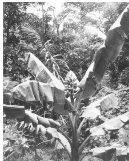
FIG. 1. Fe'i banana plant ( Karat ) with erect bunch.

Karat has been eaten in Micronesia for hundreds of years. A study of flora was carried out in Kosrae, one of the four Federated States of Micronesia, in the 1830s [155]. At that time four banana cultivars were documented: Usr Kulasr (Kosraean for Karat ), Usr Kolontol ( Uht en Yap in Pohnpei), and two non-Fe'i cultivars, Usr Wac and Usr Kuria . All four cultivars are carotenoid-rich (table 1). Informants emphasize that there was greater consumption of these in the past.