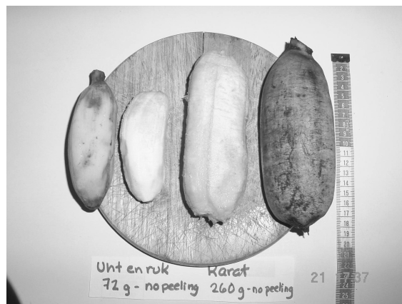
FIG. 2. Fe'i bananas ( Karat ), one unpeeled (far right) and one peeled (second from right), showing shape, size, and darker shades of skin and flesh compared to a common Micronesian banana, unpeeled (far left) and peeled (second from left).

Bananas are a crop that is easy to grow in a tropical climate. They do not require replanting or seed purchase, and they generally bear fruit throughout the year, providing ongoing availability, unlike some other crops [124]. Although there is no “perfect banana cultivar,” when pest and disease resistance, yield, taste, and nutri-